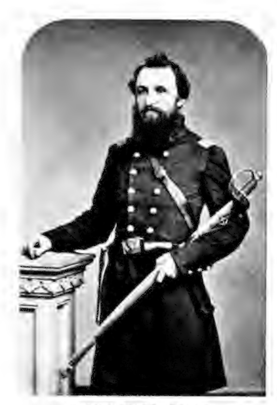
COLONEL CHARLES ALBRICHT